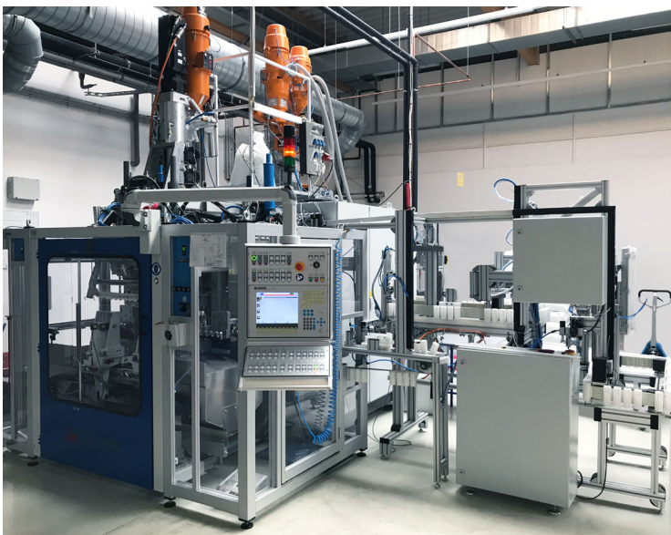
Tube production facility at Minitube

Therefore in the third level of the Minitube quality assurance program, the absence of NIAS is controlled with routine testing of the raw materials for endocrine disruptors and plasticizers like Bisphenol A, phthalates and adipates as well as heavy metals.